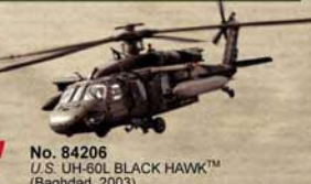
Bell Helicopter No. 84206 U.S. UH-60 BLACK HAWK™ (Baghdad, 2003) BLACK HAWK and SIKORSKY are registered trademarks of Sikorsky Aircraft Corporation. They are licensed throughout the world to Unimax Toys Limited. The Black Hawk helicopter design is the sole property of Sikorsky Aircraft Corporation. The design is licensed to Unimax Toys Limited.