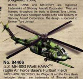
No. 84406 U.S. MH-60G PAVE HAWK™ (Eglin Air Force Base's Hurtburt Field) PAVE HAWK, SIKORSKY, the Wengert S and the Pave Hawk helicopter design are trademarks of Sikorsky Aircraft Corporation. They are licensed throughout the world to Unimax Toys Limited.