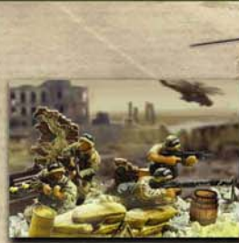
No. 83202 U.S. 101ST AIRBORNE DIVISION (Kuwait, 1991)