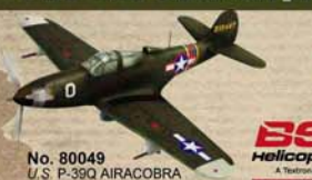
No. 80049 U.S. P-39 AIRACOBRA