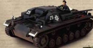
NEW No. 81016 GERMAN STURMGESCHÜTZ III AUSF. B (Eastern Front, 1941)