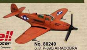
No. 80249 U.S. P-39 AIRACOBRA (Makin Island, 1943)