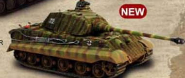
No. 80054 GERMAN KING TIGER (PORSCHÉ TURRET) (France, 1944)