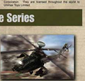
No. 85308 U.S. AH-64D APACHE LONGBOW™ (Iraq, 2004)