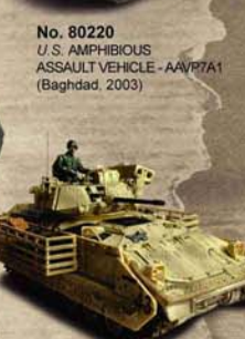
No. 80220 U.S. AMPHIBIOUS ASSAULT VEHICLE - AA/P7A1 (Baghdad, 2003)