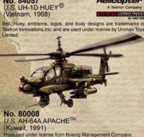
No. 80008 U.S. AH-64A APACHE™ (Kuwait, 1991) Produced under license from Boeing Management Company. AH-64A Apache, AH-64D Apache Longbow & Boeing are among the trademarks owned by Boeing.