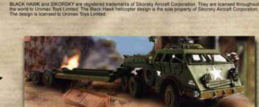
No. 85044 U.S. M26 DRAGON WAGON (France, 1944)