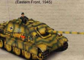
No. 80312 GERMAN JAGDPANZER (Germany, 1944)