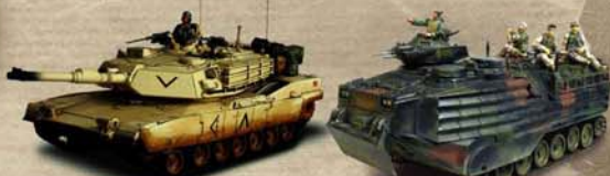
No. 80005 U.S. M1A1 ABRAMS™ (Kuwait, 1991) Abrams is a trademark of General Dynamics Land Systems and is used under license to Unimax Toys Limited.