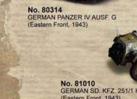
No. 80314 GERMAN PANZER IV AUSF. G (Eastern Front, 1943)