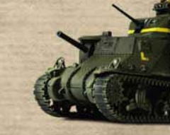
No. 81311 U.S. M3 LEE (Tunisia, 1942)