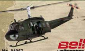
No. 84057 U.S. UH-1D HUEY® (Vietnam, 1968) Bell, Huey, emblems, logos, and body designs are trademarks of Bell Helicopter and are used under license by Unimax Toys Limited.