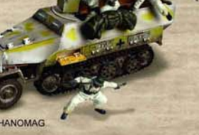
No. 81010 GERMAN SD. KFZ. 251/1 HANOMAG (Eastern Front, 1943)