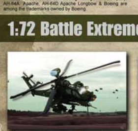
No. 85208 U.S. AH-64D APACHE LONGBOW™ (Iraq, 2003) Produced under license from Boeing Management Company. AH-64A Apache, AH-64D Apache Longbow & Boeing are among the trademarks owned by Boeing.