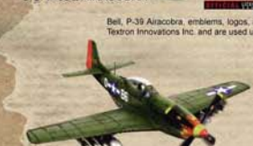
No. 80523 U.S. P-51D MUSTANG™ (England, 1944) Produced under license from Boeing Management Company. P-51 and North American are among the trademarks owned by Boeing.