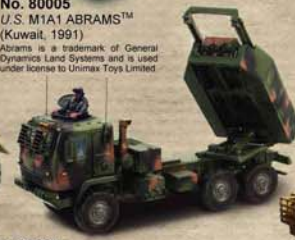
No. 80007 LOCKHEED MARTIN U.S. M142 HIGH MOBILITY ARTILLERY ROCKET SYSTEM® LOCKHEED MARTIN, HIMARS, High Mobility Artillery Rocket System, MLRS, Multiple Launch Rocket System, associated emblems and logos, and body designs of vehicles are either registered trademarks or trademarks of Lockheed Martin Corporation in the USA and/or other jurisdictions, used under license by Unimax Toys Limited.