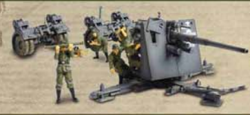
No. 80034 GERMAN 88 MM FLAK GUN (Stalingrad, 1942)