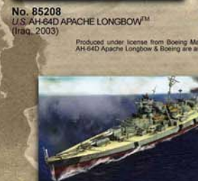
No. 86001 1:1000 GERMAN BATTLESHIP BISMARCK (Poland, 1941)