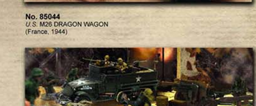
No. 85048 U.S. M3A1 HALF-TRACK AND 105 MM HOWITZER SET (France, 1944)