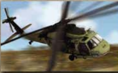
No. 85506 U.S. UH-60 BLACK HAWK™ (Desert Storm, 1991)