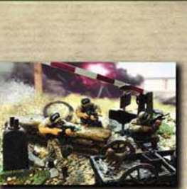
No. 83201 U.S. 24TH INFANTRY DIVISION (Kuwait, 1991)