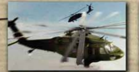
No. 85006 U.S. UH-60 BLACK HAWK™ (Iraq, 2003)